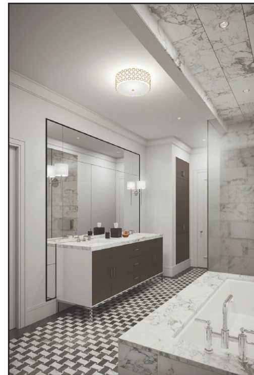
..... The master baths will feature a glass-enclosed shower and a deep soaking tub set into a marble deck, and the wide vanity will be topped with matching marble. The floor will have alternating light and gray marble tiles.