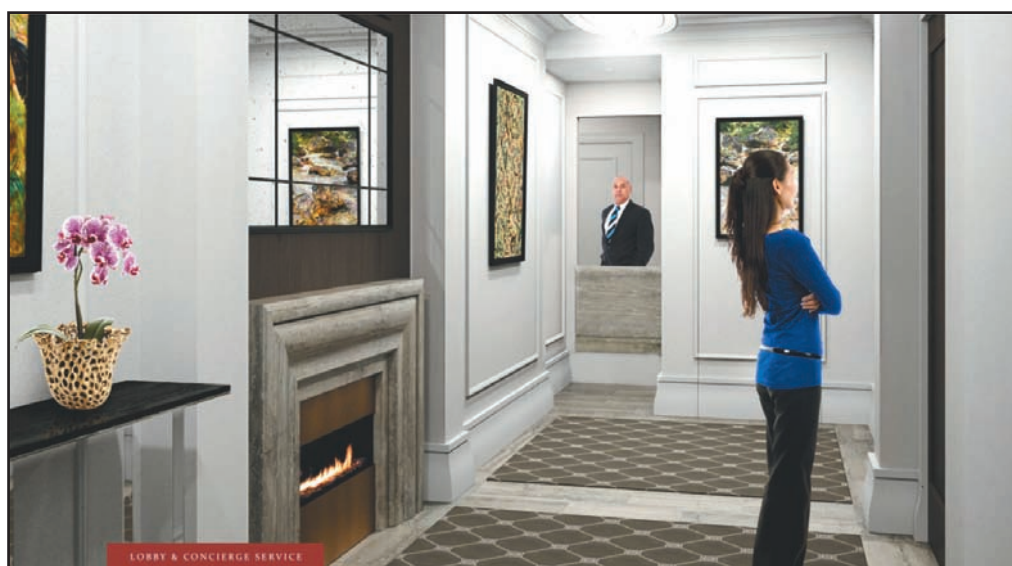
The entry lobby will have pewter carpeting by Landry & Arcari, bordered by Athens Gray marble, crown molding and picture molding. This area will hold ribbon gas fireplace, a direct-access elevator and a concierge desk.

Listed at $6.65 million, Residence 3 encompasses the entire third floor of the