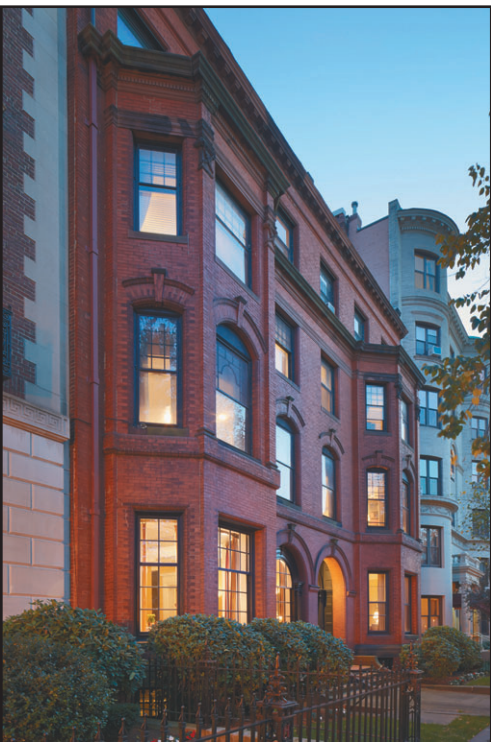
..... The buildings that will house the Residences at the Harvard Club were constructed in 1883, 25 years before the Harvard Club was established. Architects Parker, Thomas and Rice designed the private club in 1913.

Club membership also includes reciprocity at 140 private clubs throughout the world that are affiliated with the Harvard Club.