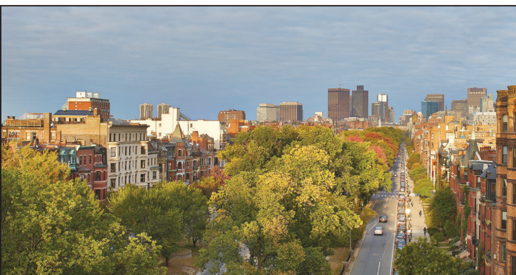
The view from the rooftop extends from Commonwealth Avenue to Downtown Boston and sweeps across Back Bay.